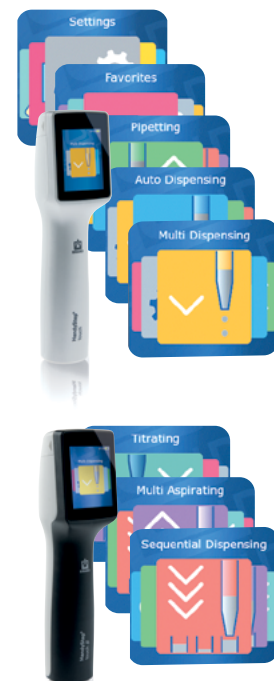
Expanded functionality on the HandyStep® touch S:

The clearly structured menus make fast work with intuitive operation possible, while the most important functions and parameters are always in view.