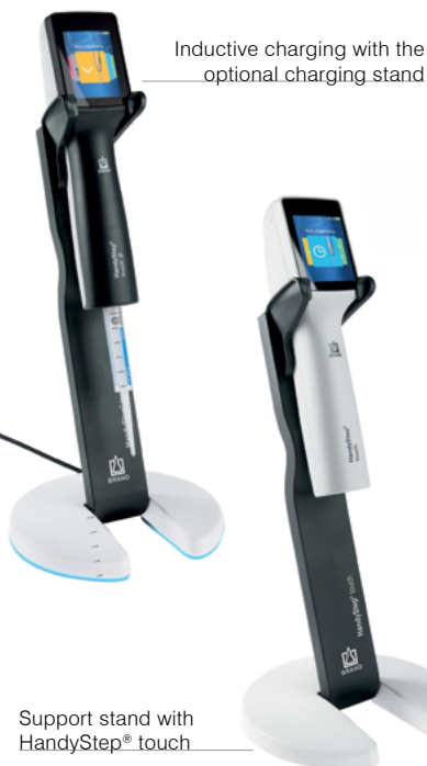
Support stand with HandyStep® touch

Inductive charging with the optional charging stand