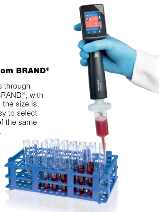
Sequential dispensing with the HandyStep® touch S and PD-Tip™ //