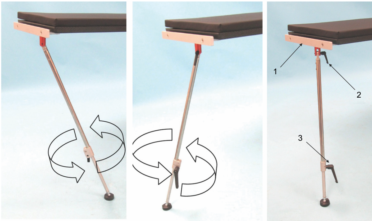
(1) End Rail • (2) Adjustable Swivel Leg Locking Handle • (3) Adjustable Height Locking Handle