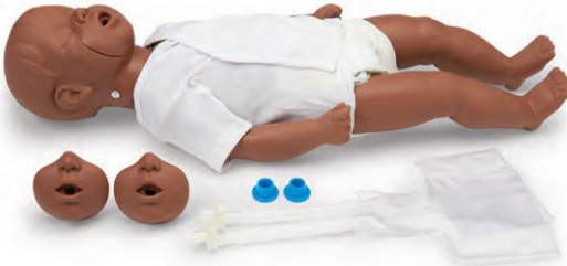
The Pediatric CPR Manikins come fully assembled and ready to use.