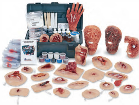
028 Xtreme Moulage Kit