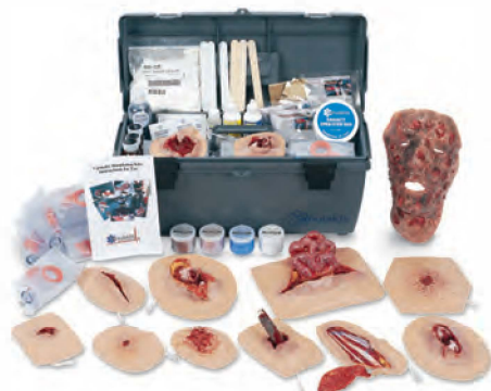
025 Xtreme Moulage Kit