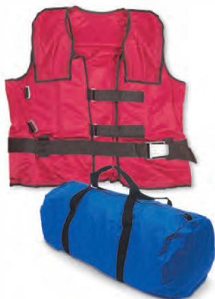
1118 Weighted Vest and 2094 Carry Bag