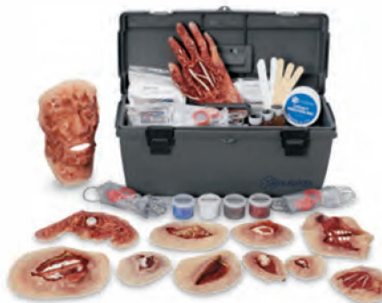
620 Xtreme Moulage Kit