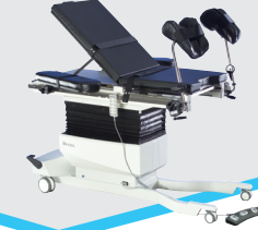
Brachytherapy C-Arm Table 810