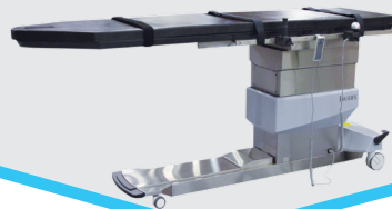
Surgical C-Arm Table 846