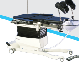
Urology C-Arm Table 800