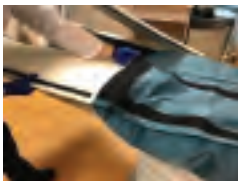
STEP 1 Turn table pad upside down and begin sliding table pad inside the cover.