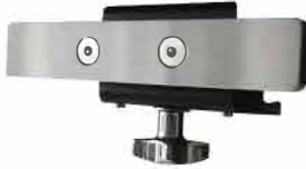
Modular Side Rails