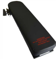
Surgical Arm Boards *Require siderails