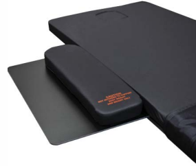
Rectangular Arm Board