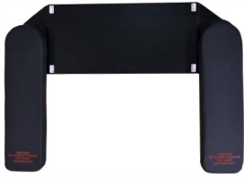
Procedural Arm Boards