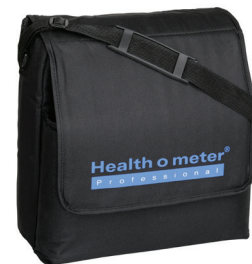
64771 Optional Carrying Case