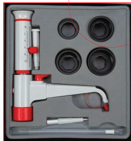
Each Diamond® SureFlow™ package includes: Bottle top dispenser, 4 threaded bottle adapters, telescopic fill tube & calibration tool