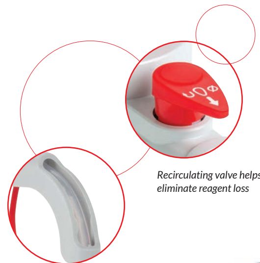
Recirculating valve helps eliminate reagent loss