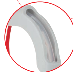
Large dispenser tube window display