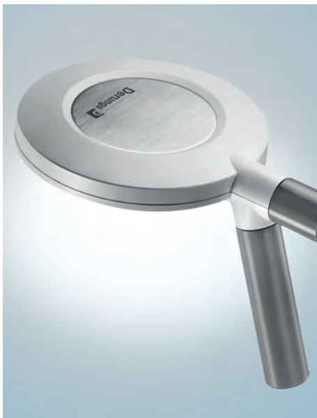
Timeless, slimline design with ergonomic handle