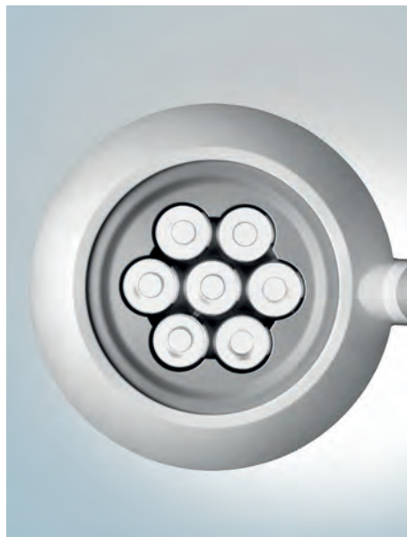
Diamond cluster optics for bright, consistent light