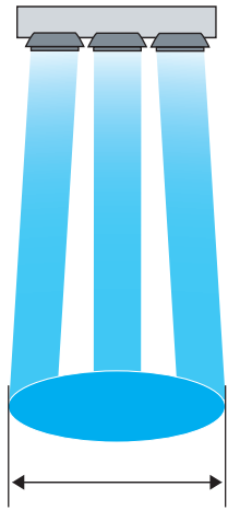
7 inches ø 180 mm approx. 50,000 lx/0.5 m