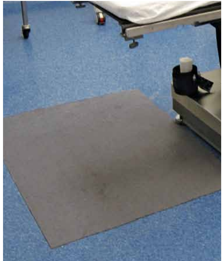
Grippy® Mat stays put to eliminate tripping and tangled cart wheels.