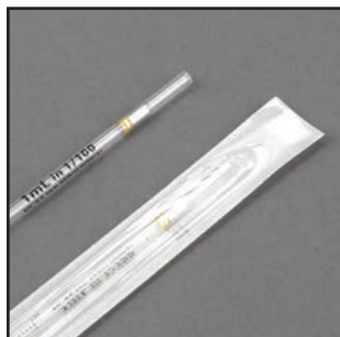
1700 - Sterile, individually wrapped