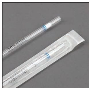
1740 - Sterile, individually wrapped