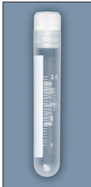
Item# 3004 (shown actual size)

All CryoClear™ cryogenic vials are sold in tamper evident, resealable plastic bags. 50 vials per bag, 10 bags per case.