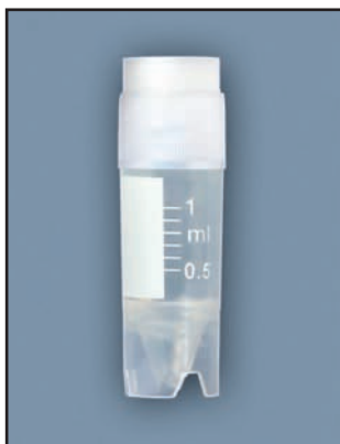
Item# 3010 (shown actual size)