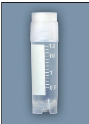
Item# 3012 (shown actual size)