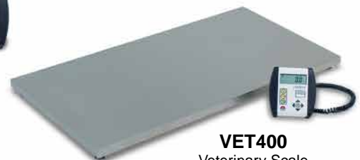
VET400 Veterinary Scale