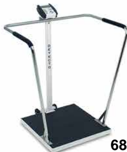
6856 Bariatric Scale