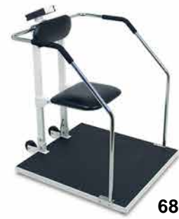
6868 Bariatric Flip Seat Scale