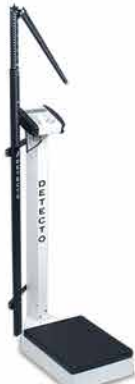
6129 Waist-High Scale With Height Rod