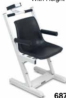
6875 Chair Scale