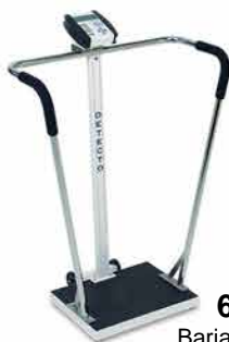
6855 Bariatric Scale