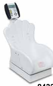
8432CH Pediatric Scale