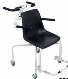
6880 Chair Scale