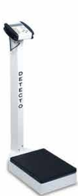
6127 Waist-High Scale