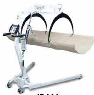
IB800 In-Bed Scale