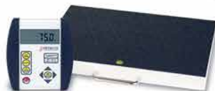
GP400-750 Platform Scale