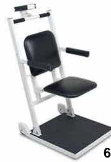
6876 Bariatric Flip Seat Scale