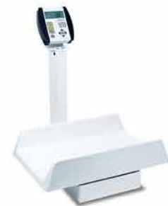
8435 Pediatric Scale