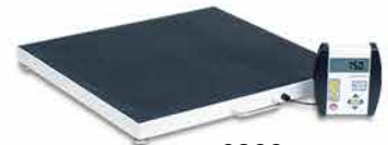
6800 Bariatric Scale