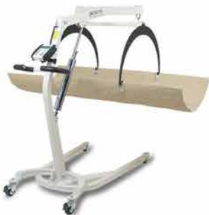
IBFL500 In-Bed Scale