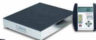
VET50 Veterinary Scale