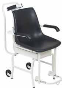
6475 Chair Scale