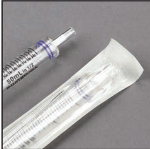
1820 - Sterile, individually wrapped