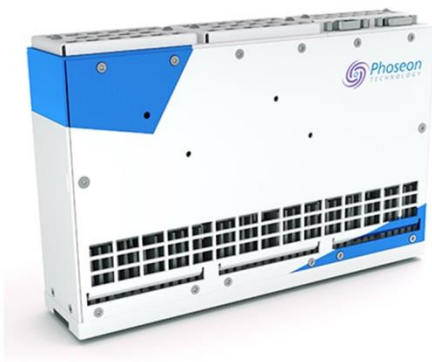
Example of ultraviolet light for disinfection of laboratory surfaces and clinical instruments

High irradiance UV-C LED when combined with appropriate wavelengths, targets specific chemical bonds and molecular interactions in DNA, RNA and proteins as well as within microorganisms and biomolecules. This allows shorter inactivation times while improving overall efficacy of the disinfection. The high absolute irradiance of these new solutions enable high-throughput processes in pharmaceutical, sequencing, air handling and manufacturing facilities.