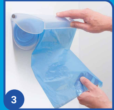
3 Press down gently on Receptacle lid with one hand