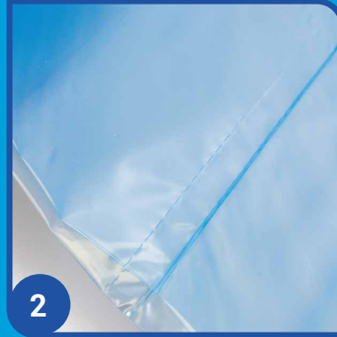
2 Pull Liner until it reaches Perforation