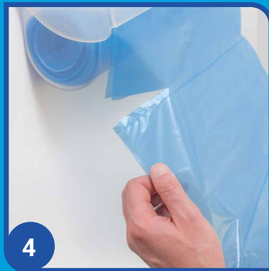
4 Tear gently across perforation