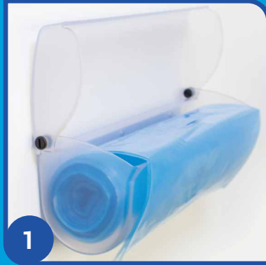
1 Put roll of Liners in Receptacle feeding from the top